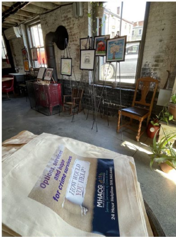
4-25; Information Table

A digital billboard displaying two ads was purchased for most of April to advertise Victim's Rights Week and the event on April 25th. During Victim's Rights Week, the Crime Victim Advocates held three separate information sessions around Cleveland County. These sessions were used to help communicate services available to victims, along with advertising Victim's Rights Week and the big event held on April 25th. On the day of the event, they had a community resource fair. Participants such as a dog therapy team, Abuse Prevention Council, and others had information tables regarding the services they provide to victims of crime. CAP funds were used to purchase a banner, digital billboard, car magnets, yard signs, survivor storyboard supplies, and media advertisements.